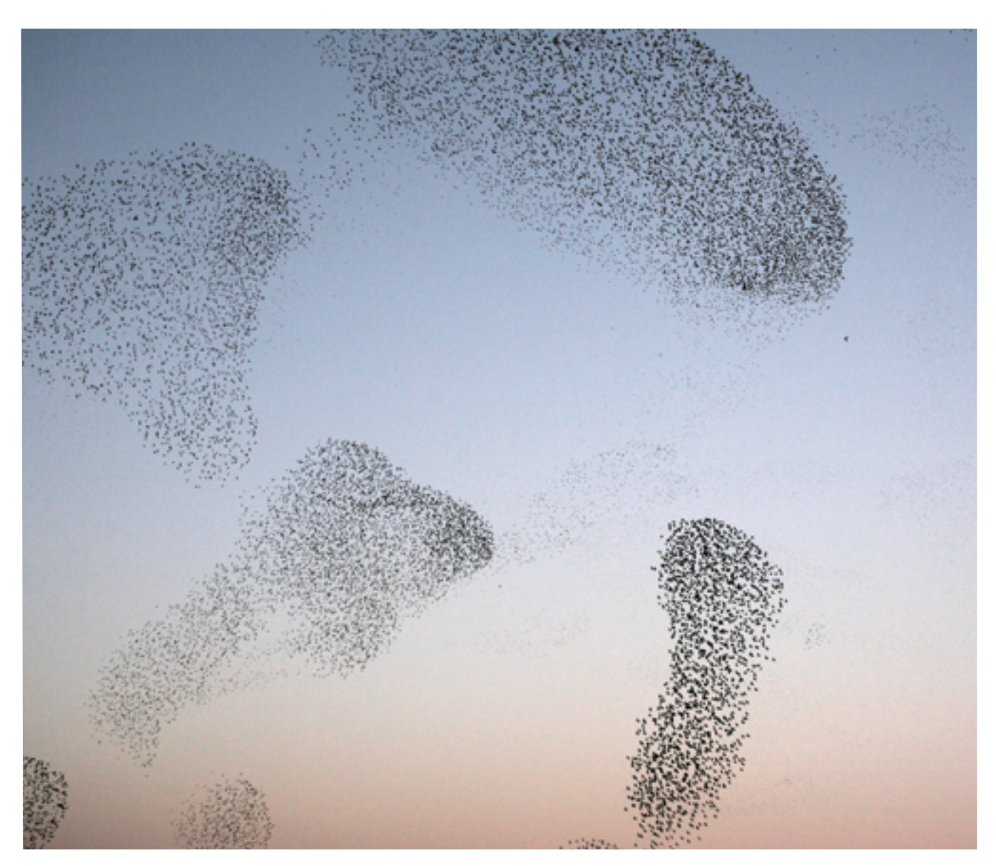
Many thousands of starlings gather on winter evenings in Rome, where they make soaring display flights before roosting for the night in trees near the main railway terminal. A project called STARFLAG has employed stereophotography and computer analysis of images to determine the three-dimensional positions and velocities of birds in starling flocks. (The flocks successfully analyzed have up to about 4,000 members; some of the groups visible in this photograph are probably even larger.) The newly acquired 3D data suggest some revisions and refinements to algorithmic models that seek to explain how the birds coordinate and synchronize their movements. (Image reproduced courtesy of the STARFLAG project, INFM-CNR [Istituto Nazionale per la Fisica della Materia, Consiglio Nazionale delle Ricerche]).

tation of flocking behavior. And the boids did it without any need for leaders or thought transference. Each boid attends to a few near neighbors, ignoring the rest of the flock, and obeys three simple rules: